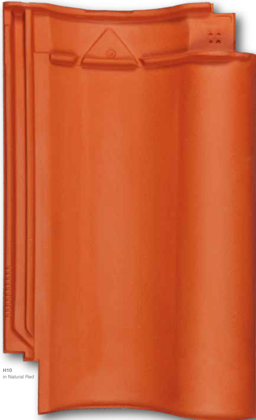
H10 in Natural Red